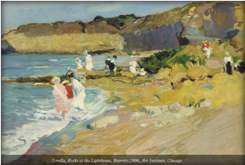
Sorolla, Rocks at the Lighthouse, Biarritz, 1906, Art Institute, Chicago