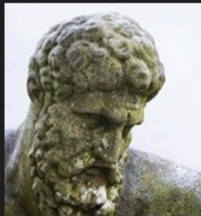
After the Antique: A life sized carved marble figure of The Farnese Hercules. Sold for £14,950