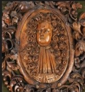
A Charles II carved limewood portrait plaque, workshop of Grinling Gibbons. Sold for £5,200